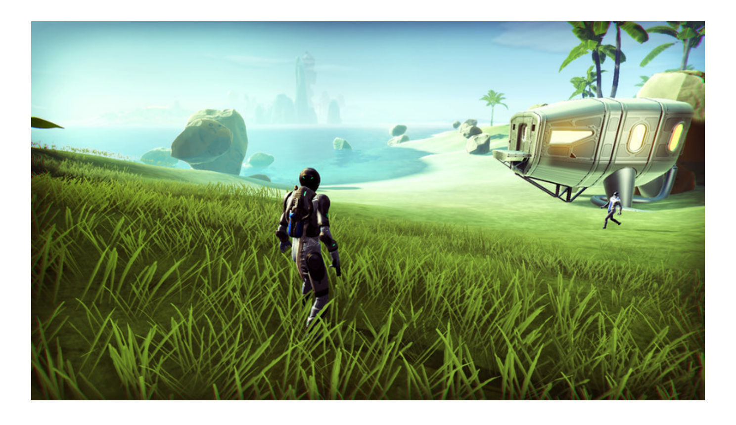
Flock! Download No Crack

Download >>> <a href="http://bit.ly/2SN4lrb">http://bit.ly/2SN4lrb</a>